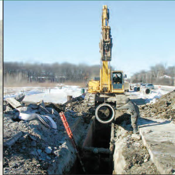
IL Route 22 Watermain, Lincolnshire, IL